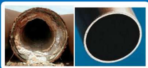
SOFT NO R System eliminates previous scales within few weeks